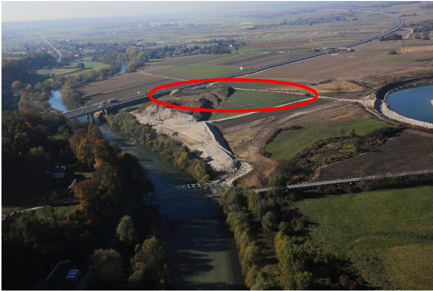
Dumping area during construction works in 2016