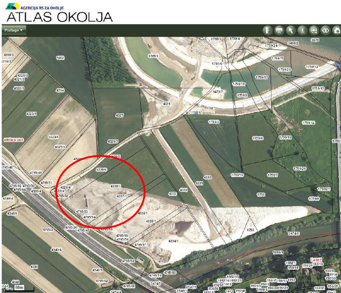
Dumping area in 2014, number of the plot: 4338/1