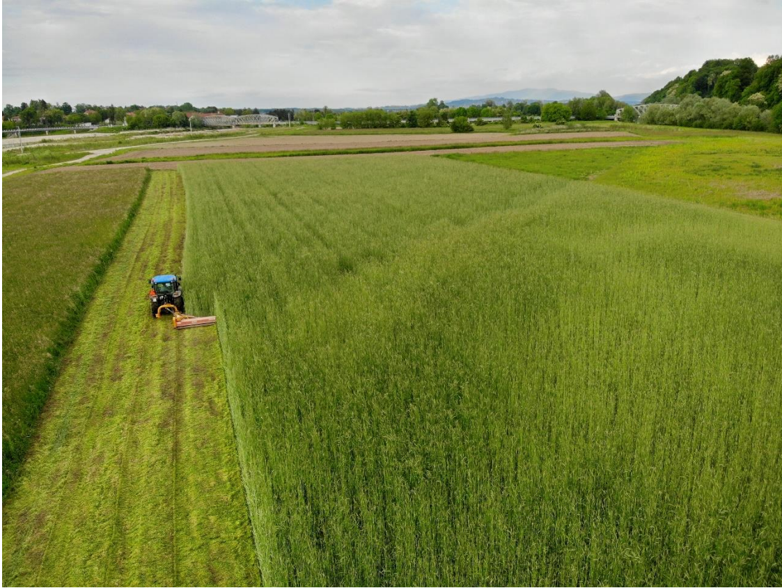
Mulching winter mixture

April 2020, grass clover mixture, sowed in September 2019